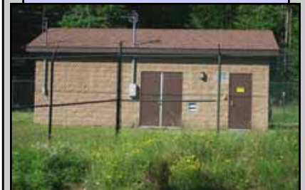
Facility #2 (Ground Water) 1.152 MGD by Permit

The main source of water is Laurel Hill Creek located in Jefferson Township .