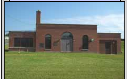
Facility #3 (Ground Water) .864 MGD by Permit

The newest System is the Shaffer Run Well System. Two wells are located on 650 acres of land owned by the Authority.