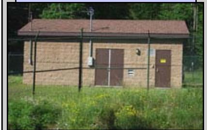
Facility #2 (Ground Water) 1.152 MGD by Permit

The main source of water is Laurel Hill Creek located in Jefferson Township .