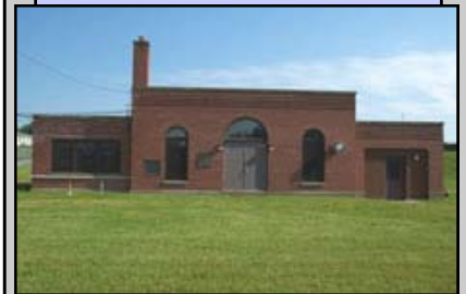
Facility #3 (Ground Water) .864 MGD by Permit

The newest System is the Shaffer Run Well System. Two wells are located on 650 acres of land owned by the Authority.