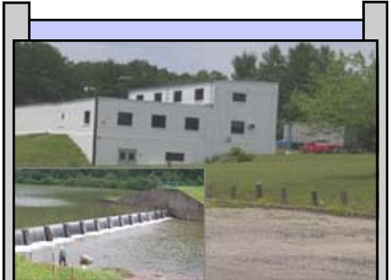
Facility #1 (Surface Water) 1.75 MGD by Permit

The main source of water is Laurel Hill Creek located in Jefferson Township .